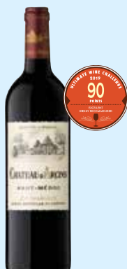
Chateau D'Arcins 2015 Haut-Medoc 90