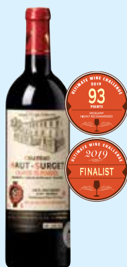
Chateau Haut Surget 2015 Lalande de Pomerol 93 - FINALIST