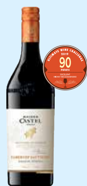
Maison Castel Grande Reserve Cabernet Sauvignon 2017 Pays d'Oc 90