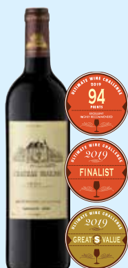
Chateau Malbec 2016 Bordeaux 94 - FINALIST GREAT VALUE