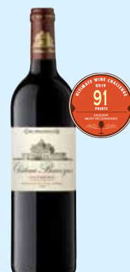
Chateau Barreyres 2016 Haut-Medoc 91