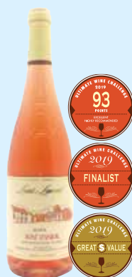
Louis Laurent 2018 Rosé d'Anjou 93 - FINALIST GREAT VALUE