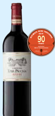
Chateau Tour Prignac 2015 Medoc 90