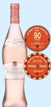
Aime Roquesante 2018 Cotes du Provence Rosé 90 - TRIED & TRUE