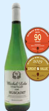
Michel Lelu Muscadet 2018 Loire Valley 90 - GREAT VALUE