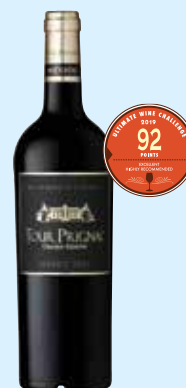
Tour Prignac Grand Reserve 2016 Medoc 92