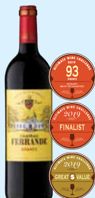
Chateau Ferrande 2016 Graves 93 - FINALIST GREAT VALUE