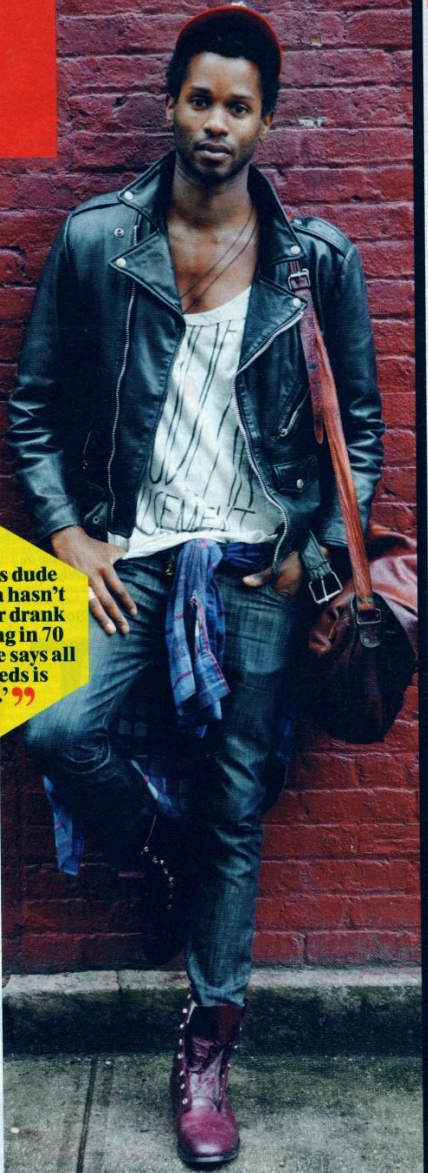
For more faces of New York City, go to timeoutnewyork.com/publiceye .

“This dude in India hasn't eaten or drank anything in 70 years. He says all he needs is 'om.'”