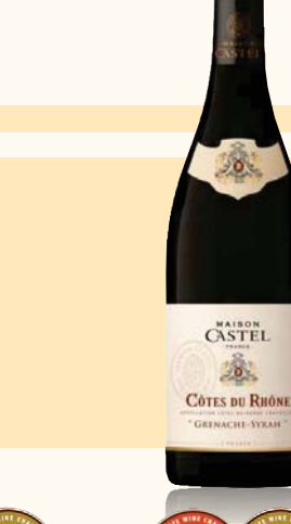
Maison Castel Grenache-Syrah 2016 Cotes du Rhone