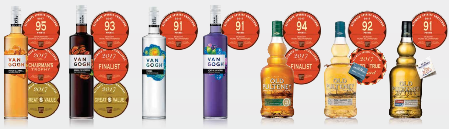
VAN GOGH VODKA

AN AWARD-WINNING PORTFOLIO UNLIKE ANY OTHER