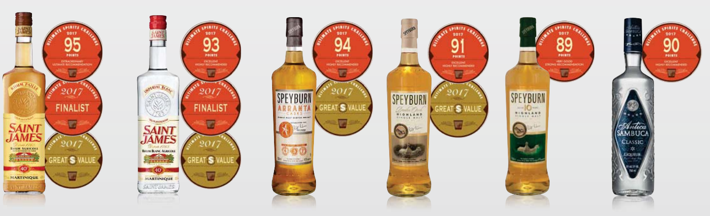
SAINT JAMES RHUM